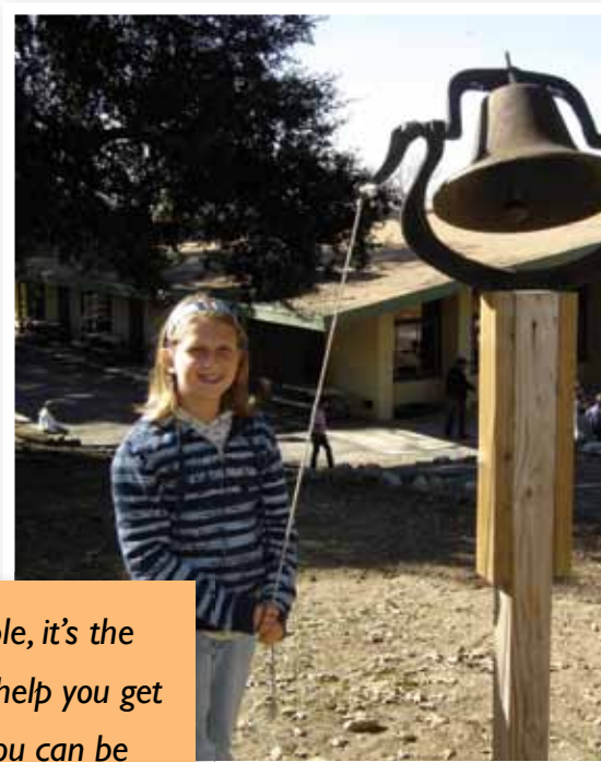
Ring in another summer!