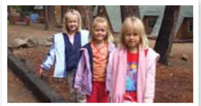
Family campers from Memorial Day 2008 weekend at ECP.