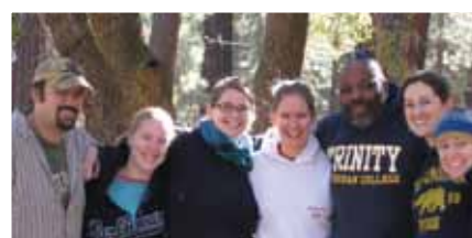
Full time youth workers away at camp.