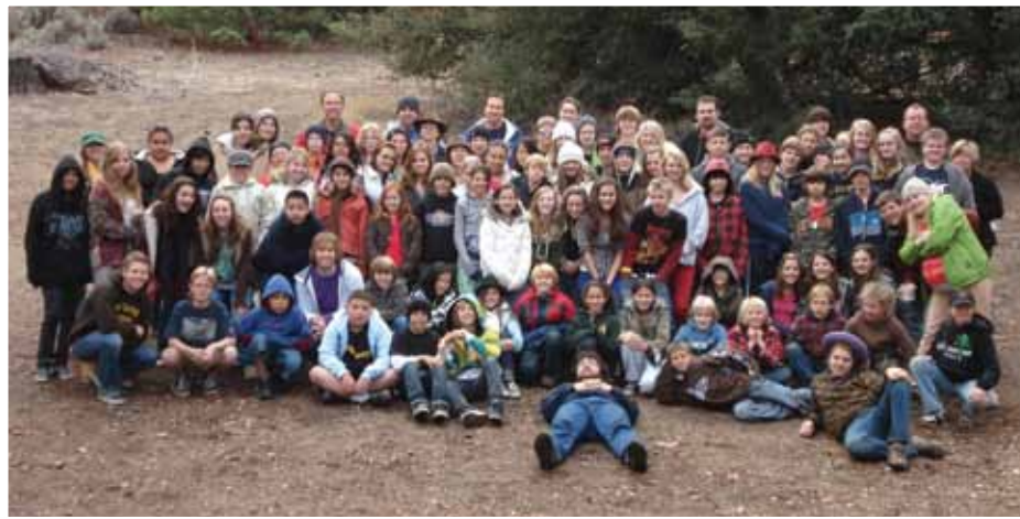
One of the 2009 Winter Retreats at El Camino Pines

We offer Lutheran Christian Camping and retreat programs for all ages at our two main sites, El Camino Pines and YOLIJWA/Luther Glen, as well as off-site high adventure opportunities. Our ministry spans Southern California—from the mountains to the ocean, the deserts to the beaches and the wilderness to the cities.