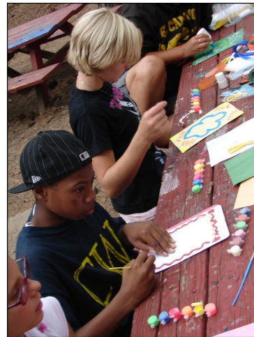
Left and Below: 2007 Campers