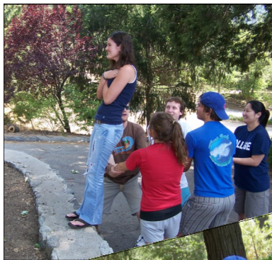
Left and Below: 2007 Staff Trust Falls

Nearly 70 percent of ELCA seminarians – especially those going directly from college to seminary – list church camp as a major influence on their decision to go to seminary.