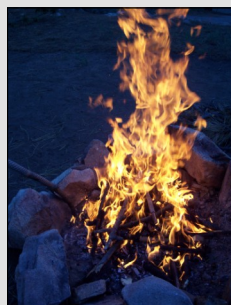
Fire Ecology class added to curriculum